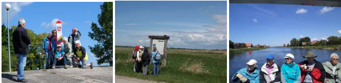
Rusne, border Lithuania/Russia Hiking through Nemunas delta Boattrip on th