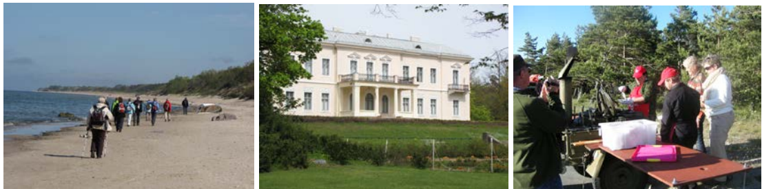
Hiking at the beach

Hiking from Klaipeda to Palanga. Stop at the German War Cementery and at the dune cementery of the village Karkle, the old German Karkelbek. Palanga: Amber museum and Botanical Garden, leisure in the center of Palanga. In the evening picknick with "Max' field kitchen" in the dunes of Melnrage. Overnight stay Hotel EUTERPE Hiking trail: 20 km