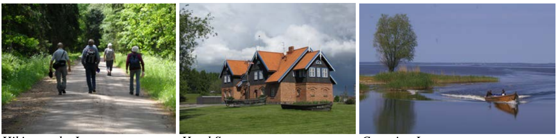
Hiking at the Lagoon

<u>4. Day</u> <u>Hiking alongside the Curonian Lagoon from Dreverna to Kintai.</u> By bus from Kintai to Vente, check in Hotel STURMU. Dinner in the hotel Restaurant – fresh fish ! Overnight stay Hotel STURMU in Vente at the Curonian Lagoon. Hiking trail: 15 km