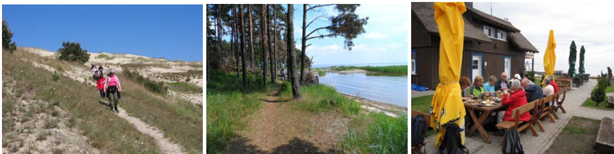
Hiking through the dunes

By bus from Juodkrante to the Nagliu Dune. Hiking from the dune to Preila. In Preila lunch, smoked fresh fish. Back by bus from Preila to Juodkrante. Dinner Hotel Restaurant VILA VITA. Overnight stay hotel VILLA FLORA Hiking trail: 15 km