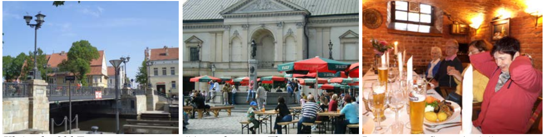
Klaipeda Old Town

Excursion Klaipeda, in the afternoon leisure. Evening: presentation "1000 years of Lithuania" Dinner Restaurant "STORA ANTIS" Overnight stay Hotel EUTERPE Hiking trail 10 km